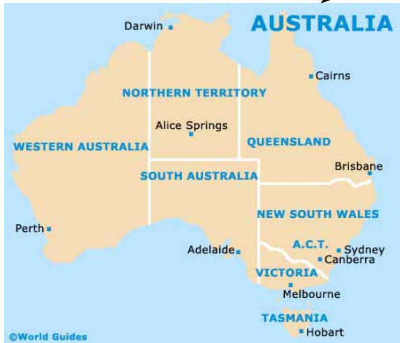
Darnley Island, Queensland