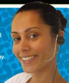
STOCK: GLEN HUGHES

To find out where your nearest AMS is call Vibe Australia on 1800 623 430.